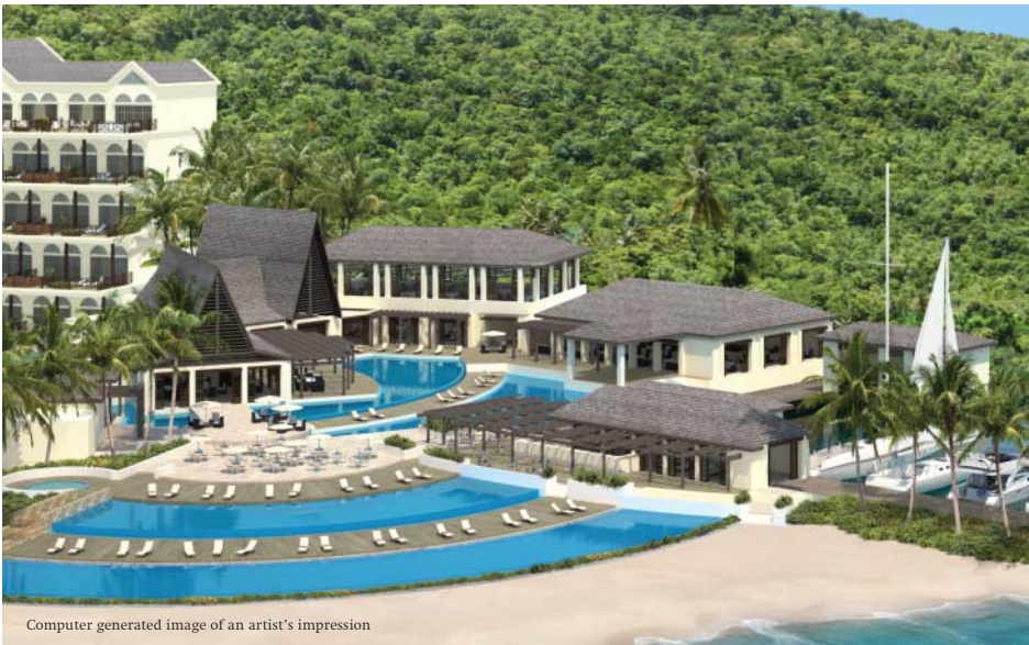
Computer generated image of an artist's impression