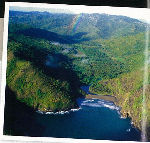
Above Gary Player Inset St Lucia, where Gary Player and his company are working on a new course for the Marquis Estate

I would have to say Saadiyat Island in Abu Dhabi. This US$28billion development is taking the world by storm and includes Louvre and Guggenheim museums, a dozen